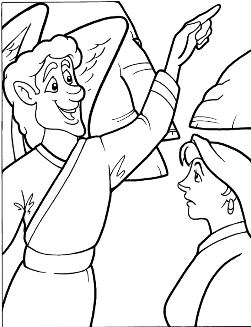
Jesus Is Alive!